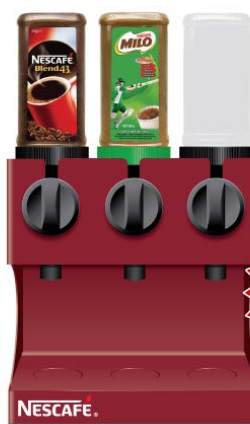
530 016 200 NESTLÉ BEVERAGE BAR STARTER KIT PRICE CHECK

The Nestlé Beverage Bar is a convenient, tidy, economical and hygienic solution for the office kitchen. BONUS $50 Gift Card offered with purchase for limited time only. Contact us for more information.