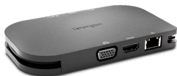
005 076 001 DOCKING STATION SD1600P UNIVERSAL USB-C BLACK $149.00