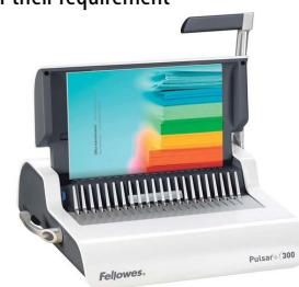
805 033 000 BINDING MACHINE PULSAR+ 300 COMB MANUAL $299.00