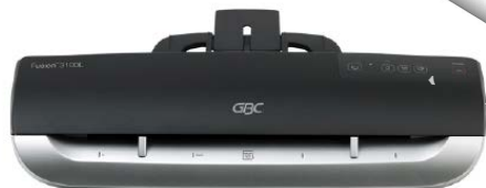
GBC Fusion 3100L (A3)