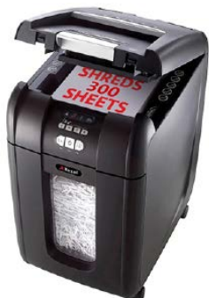
430 480 700 SHREDDER AUTO+ 300X 250 SHEET CAPACITY CROSS CUT P4 $1,285.00

Intelligent shredding for the smart generation. Auto+ smartech the world's first app connected shredder, lets you know when it's done and that your documents are secure.