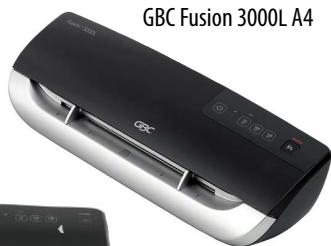
GBC Fusion 3000L A4