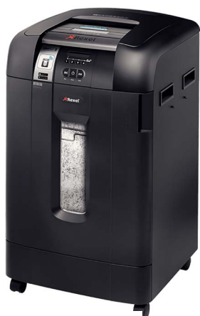
430 480 900 SHREDDER AUTO+ 750X 750 SHEET CAPACITY CROSS CUT P4 $3,525.00