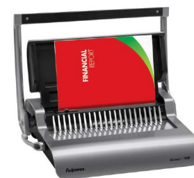
805 033 100 BINDING MACHINE QUASAR+ 500 COMB MANUAL $445.00